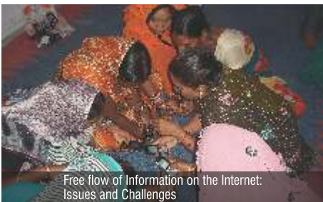
Free flow of Information on the Internet: Issues and Challenges