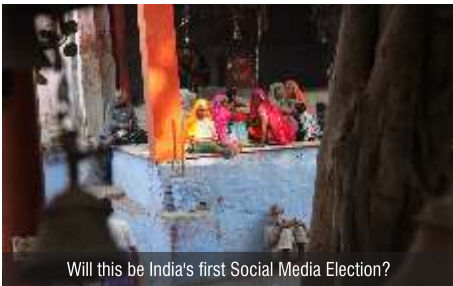
Will this be India's first Social Media Election?