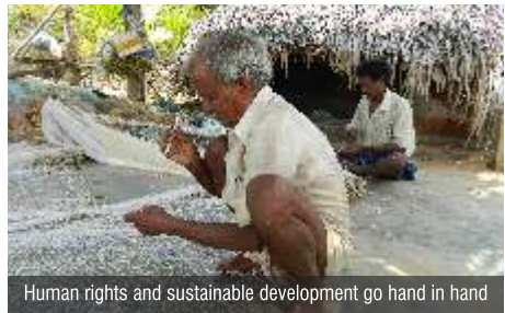
Human rights and sustainable development go hand in hand