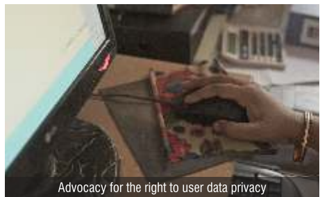
Advocacy for the right to user data privacy