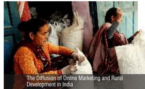
The Diffusion of Online Marketing and Rural Development in India