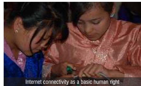
Internet connectivity as a basic human right