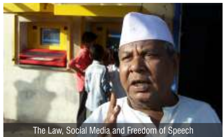
The Law, Social Media and Freedom of Speech