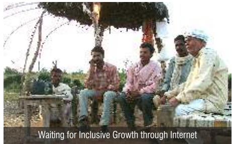
Waiting for Inclusive Growth through Internet