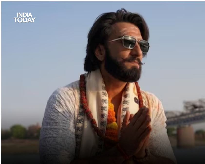
A political deepfake featuring Bollywood actor Ranveer Singh, with manipulated audio criticising Prime Minister Narendra Modi, recently emerged in India and quickly went viral online.